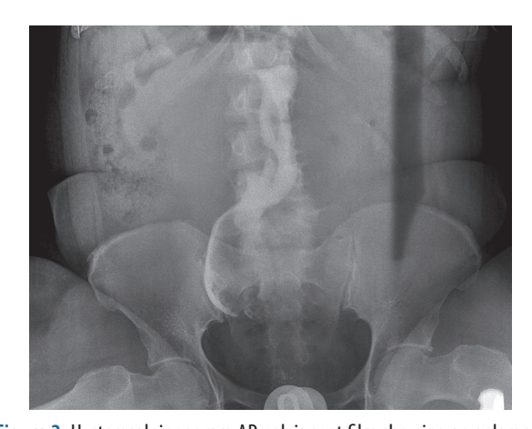
Figure 2. Hysterosalpingogram AP pelvis spot film showing an enlarged, lobulated, and elongated/thinned-out uterine cavity, which is displaced cephalad. An oval filling defect is seen at the lower uterine segment while a linear filling defect is sighted in its mid-portion (cicatrisation from previous instrumentation and/or infection). Both uterine tubes are not demonstrated. The overall picture is suspicious for multiple uterine and cervical leiomyomata with bilateral tubal blockage