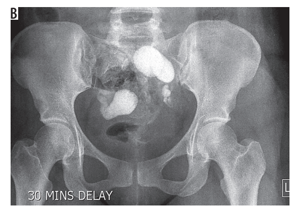
Figure 4. A) Hysterosalpingogram AP pelvis spot film showing a normal uterine cavity with bulbously dilated distal portions of the uterine tubes bilaterally, without contrast spillage into the peritoneum. B) The 30-minute delayed film shows contrast retention/loculation with within the dilated distal Fallopian tubes. These findings are conclusive for bilateral hydrosalpinges with bilateral tubal occlusion

women with hydrosalpinx were 2.12 times more likely to be infertile than those without hydrosalpinx (95% CI: 1.02-4.36, p = 0.042) (Table 7).