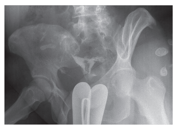
Figure 1. Hysterosalpingogram AP pelvis spot film showing a persistent, irregular/ragged filling defect centrally within the uterine cavity, which is in keeping with uterine synechiae